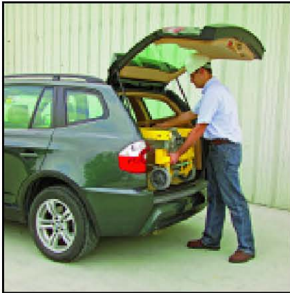
Fits in Most Vans

Forks remove and legs reposition for space saving storage.